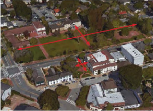
Fig 3.76 Colton Hall, Monterey, CA. The relationship of the civic buildings to the park and plaza, where the facades face the park, create a sense of accessibility. The smaller open space ties the plaza to the street and serves to define the area as a civic center. This relationship is best understood at the pedestrian scale.