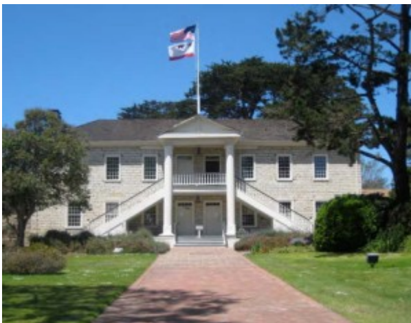
Figure 3.46: Colton Hall in Monterey, CA. Colton Hall in Monterey faces Friendly Plaza. This placement communicates a message that the building is accessible by the public.