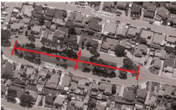
Fig 3.77 Bird's eye view of Trinity Avenue, Seaside, CA>