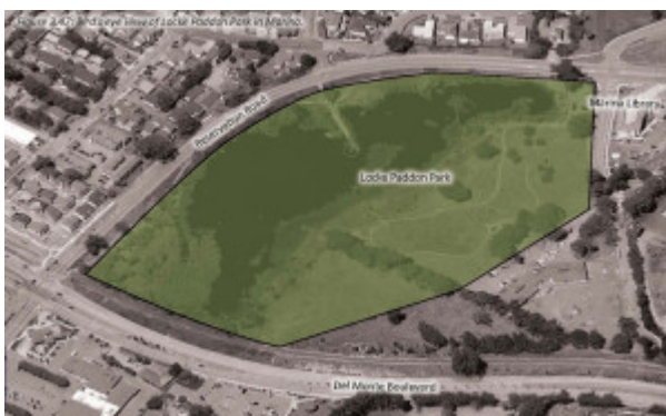
Fig 3.47 Birds-eye view of Locke Paddon Park, Marina, CA.